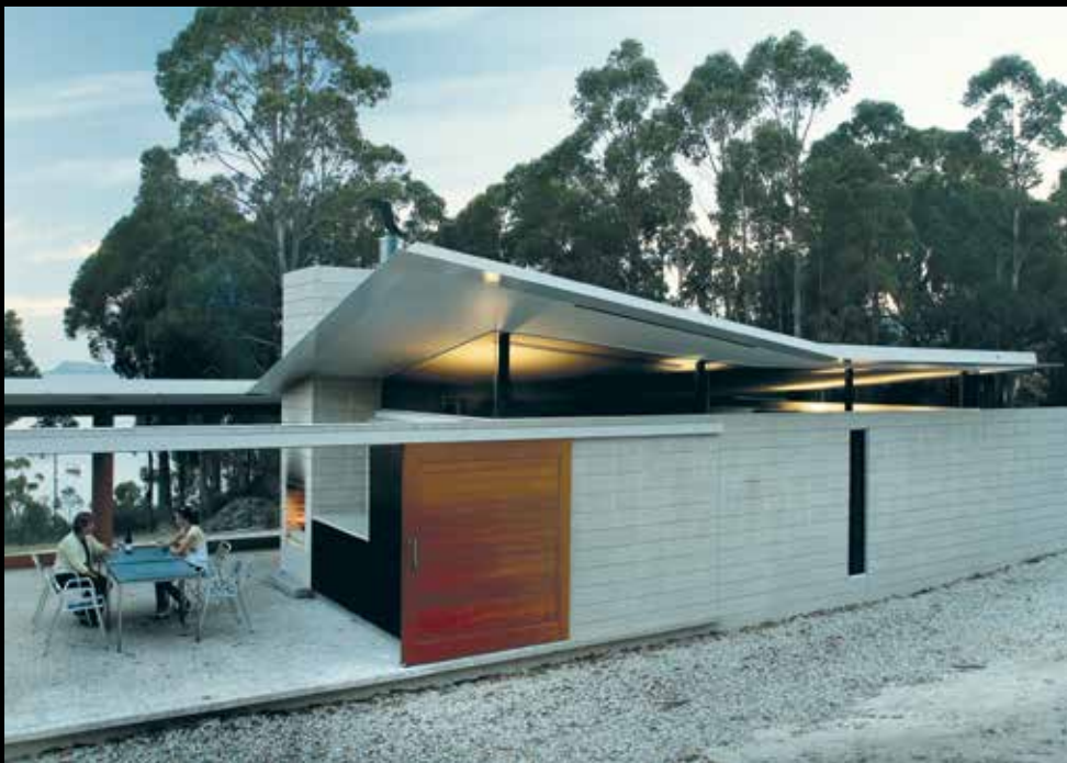
Architecture, Woodbridge Residence, recipient of the AIA James Blackburn Triennial Prize. Architecture, Patrick Street Residence.