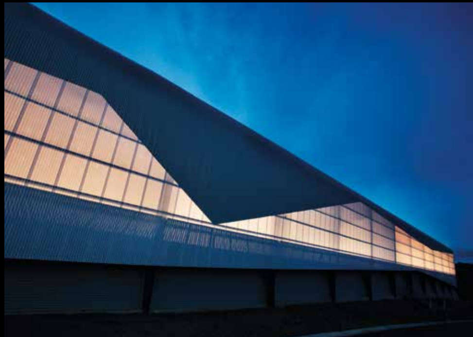
Architecture, State Gymnastics Centre and Indoor Sports Stadium, Tasmania. Spatial Design, The Barbarians, MONA FOMA