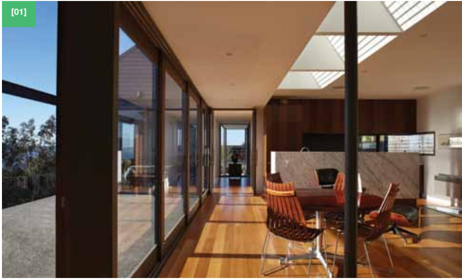
Photograph [01] [02] [03] by Peter Whyte