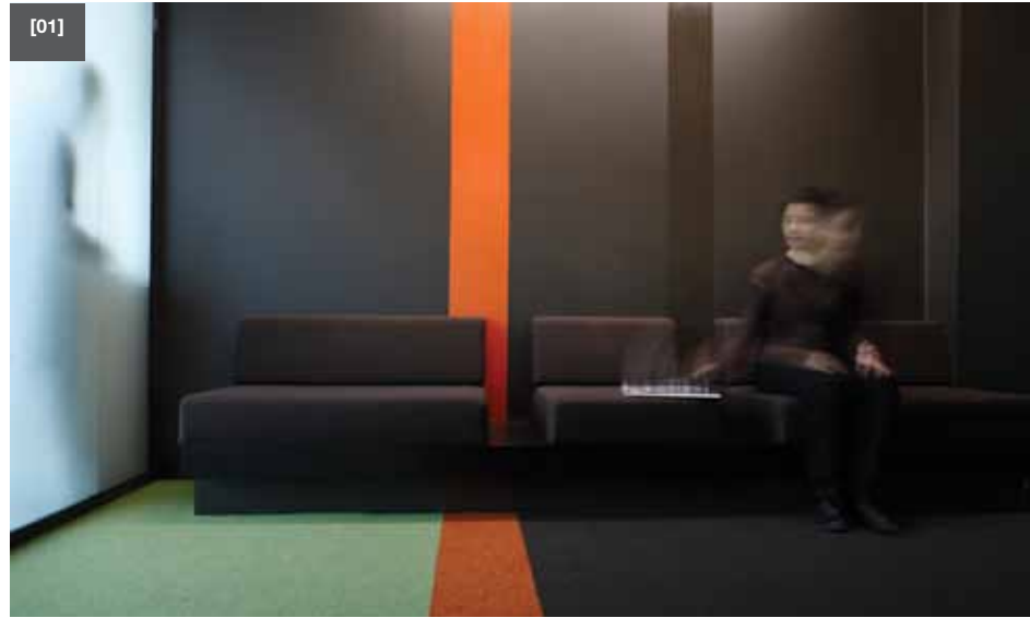
Photograph [01] [02] [03] by Peter Whyte